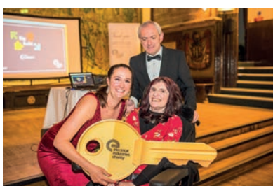
The EIC offers support to anyone within the electrical, electronics and energy industries