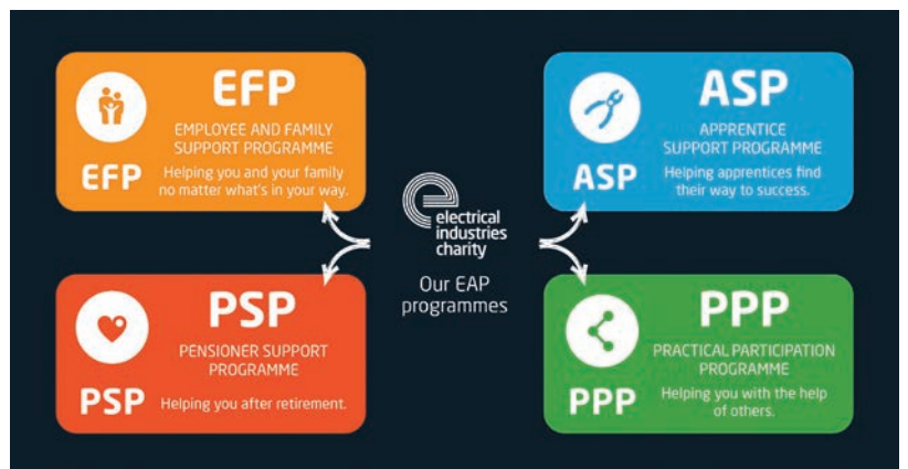
The EIC's EAP programmes

"All of us within the industry have worked hard to keep it going, and at Niglon we felt we couldn't stand by and watch