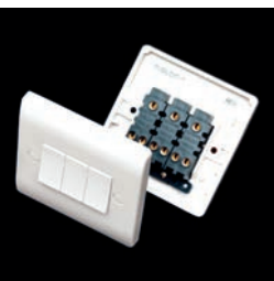
Median three-gang switch

A charity supporting individuals through bereavement, redundancy and illness is set to benefit from a new partnership with Niglon .