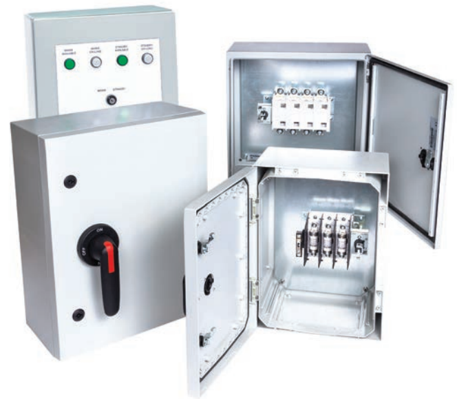
Niglon's enclosed switchgear range

One size doesn't fit all, and that's why Niglon offers a bespoke service for enclosures, distribution enclosures, and enclosed switchgear. It's comprehensive workshop facilities and laser-cutting technology allows quick and easy customisation, with the ability to form any number and size of holes in the doors or sides of a bespoke enclosure, and fully or partially glazed doors for any size of enclosure or distribution board.