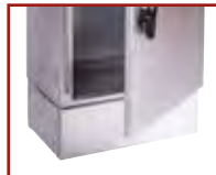
Shown mounted to a stainless steel enclosure.