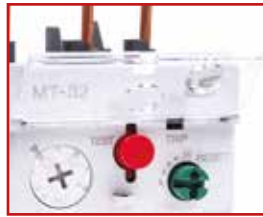
Protective cover to prevent changes being made once set.