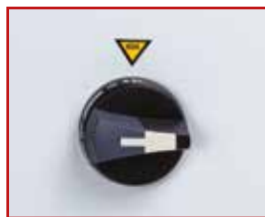
Close up of enclosed MCCB switch.