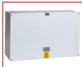
Busbar Chamber with front panel in place.